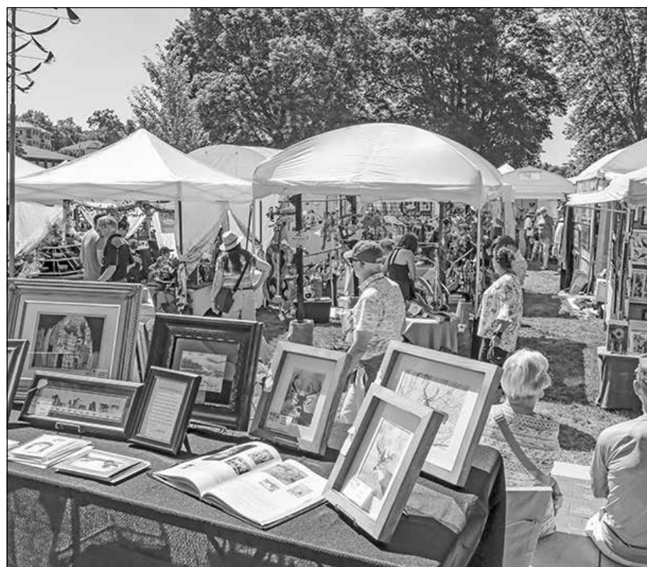
above: With 80 booths displaying a variety of art in various genres, Art in the Park offers an item for a wide swath of tastes. top: A family gathers around an artist's display of paintings and colorful fabrics.