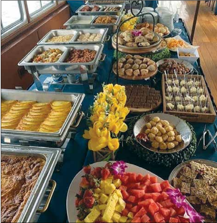
Lake Geneva Cruise Line customers can experience an array of food offerings while taking in views of Geneva Lake.

150 Elkhorn Road • Williams Bay, WI 53191 262-245-5757