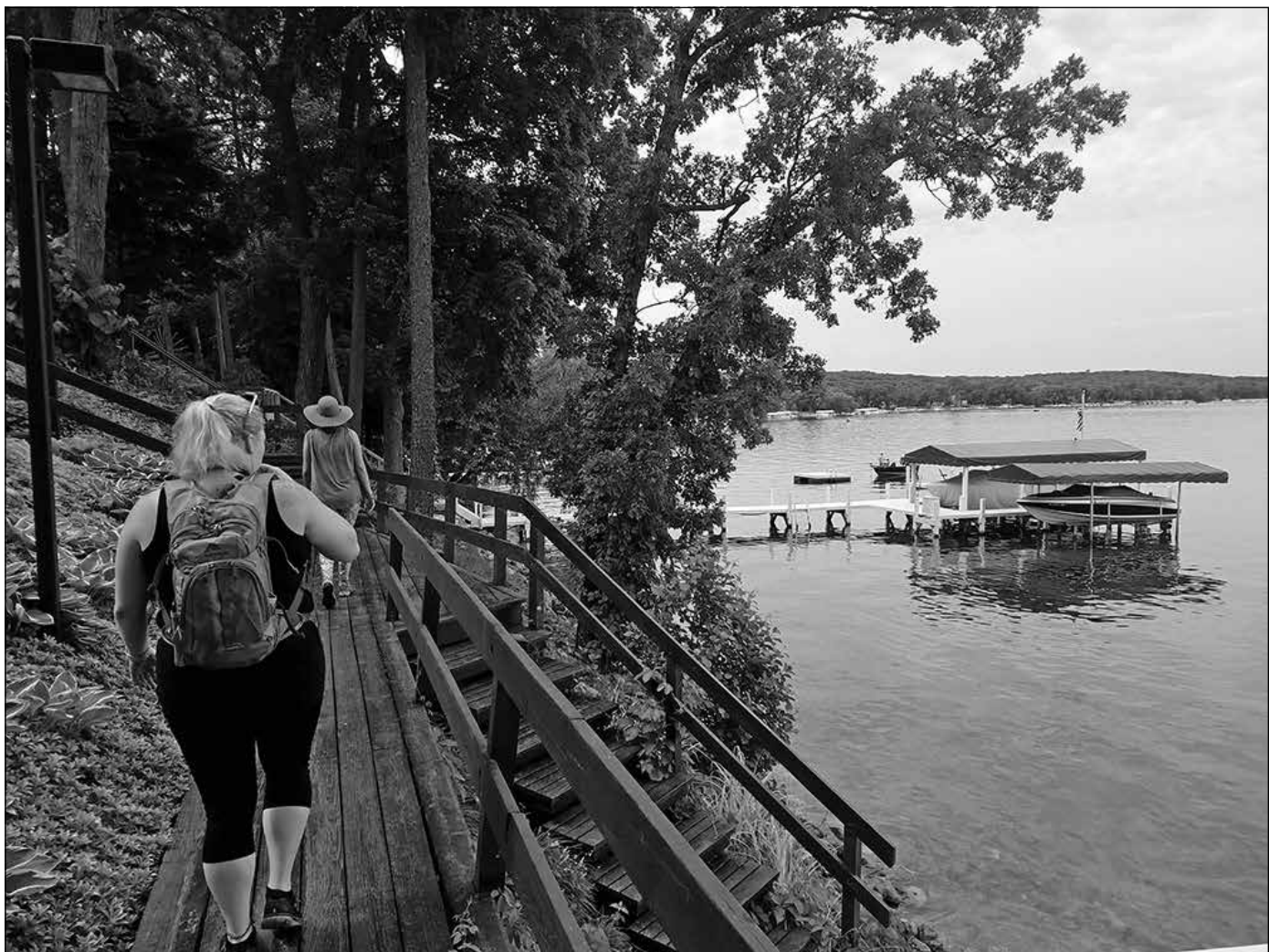
above: The Lake Geneva Shore Path winds around Geneva Lake for about 26-miles and takes 8 to 10 hours to walk in its entirety. Most people walk the path in sections. right: Signs along the shore path direct users to the path as well as to various sites along the trail.

Public access points to the path include the Lake Geneva Public Library, Big Foot Beach State Park and others in Fontana and Williams Bay.