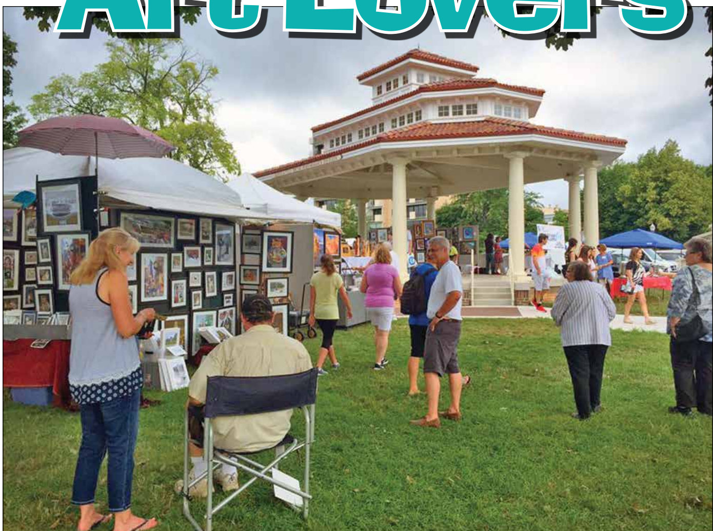
Visitors meander through Flat Iron Park enjoying displays of art during the annual Art In The Park juried art fair.