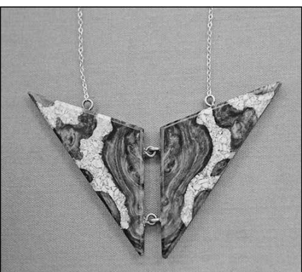
A variety of jewelry is available including pieces such as this unique necklace by Joseph Eidman made of rosewood burl and turquoise.