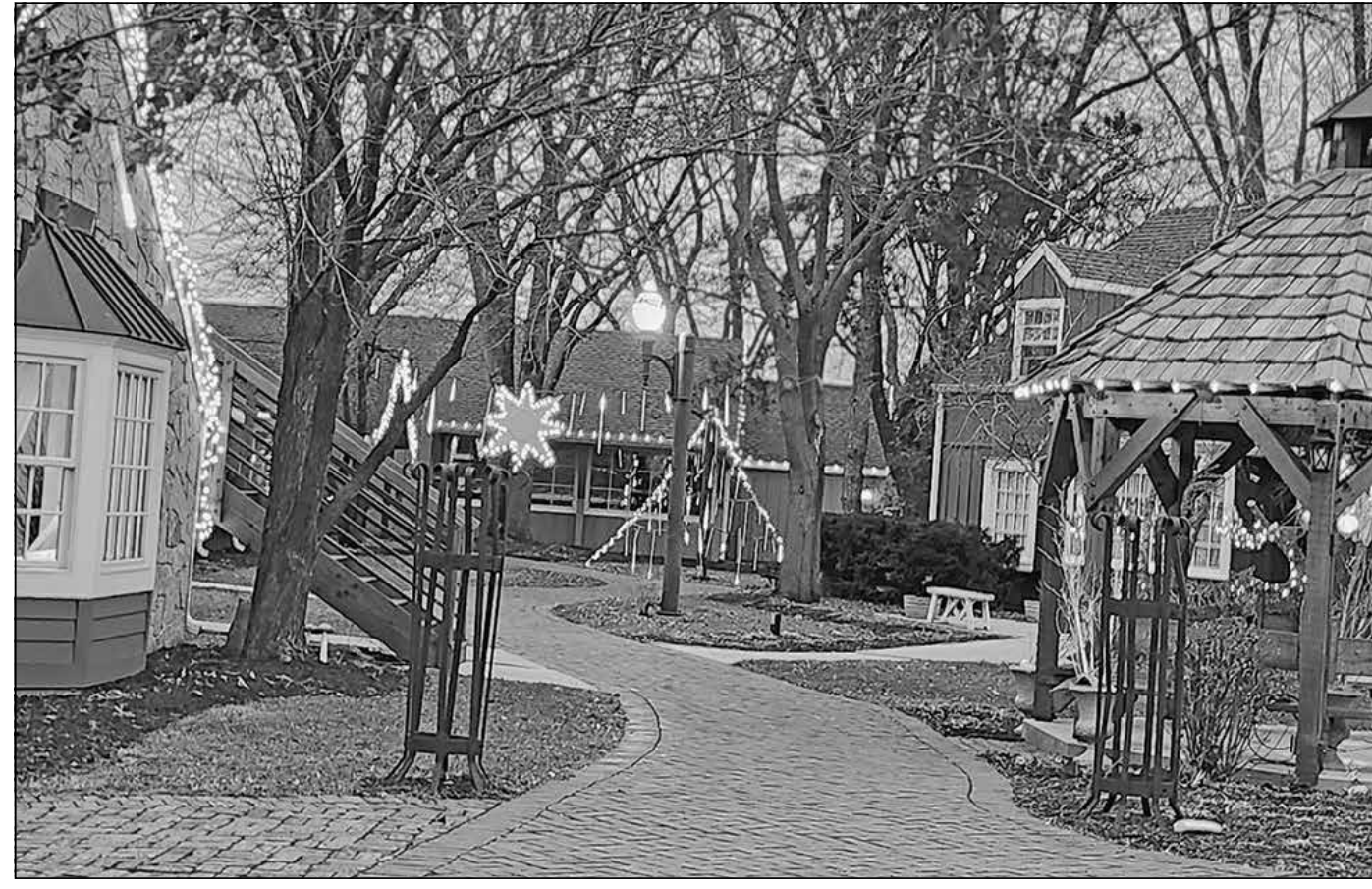
above: The grounds around Rosewood are beautiful any time of the year: in spring - when trees are sprouting to life; summer - when everything is in full bloom; fall – when the leaves turn to autumn colors, and in winter – when a soft covering of snow creates a scenic winter wonderland. top: Rosewood Dinner Theater in Delavan serves as wedding venue throughout the year, offering its "signature atmosphere" and one-stop wedding shop of services.