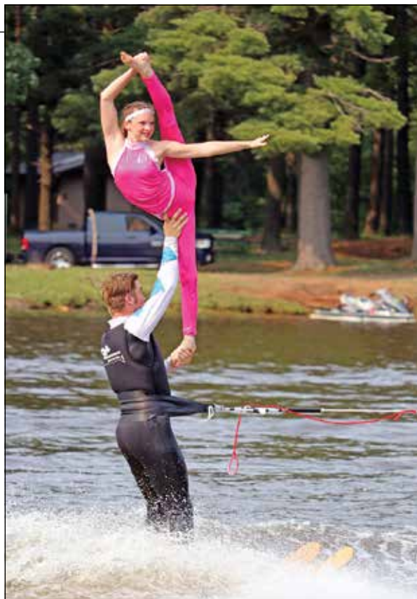
Lifting a partner high above while maintaining balance requires skill and balance and skill on the part of both participants.

While the team receives a lot of support from the community and local business, they also give back in various