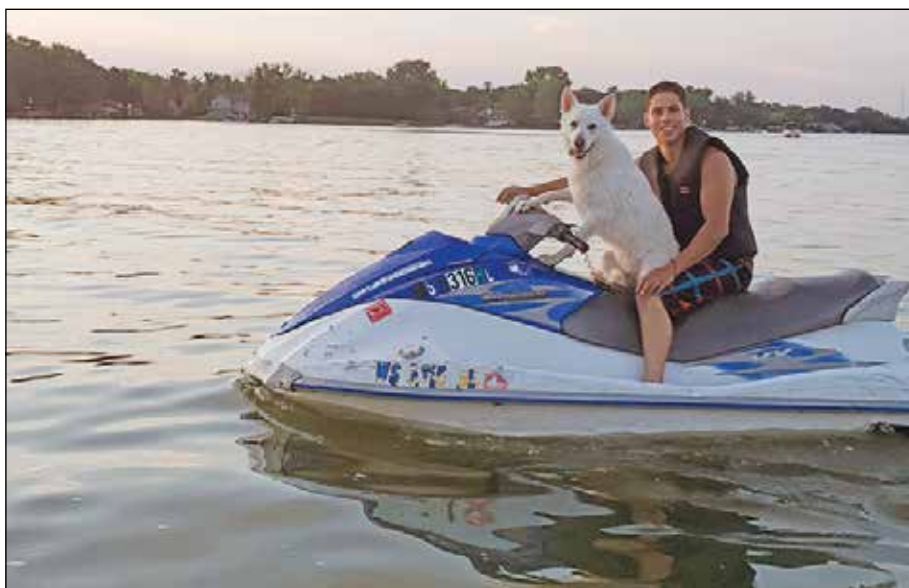
The Breeze

Fischer Park on Brown's Lake, 30326 Durand Ave., Burlington. Beach on the shore of Brown's Lake in Einer Fischer Park. Plenty of parking and picnic tables. Park is open daily with lifeguard coverage.