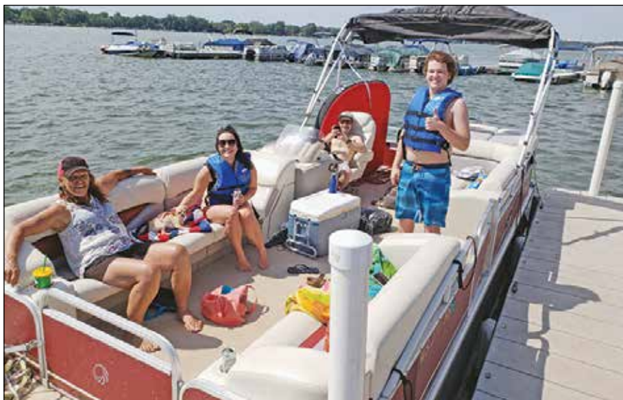
The Breeze