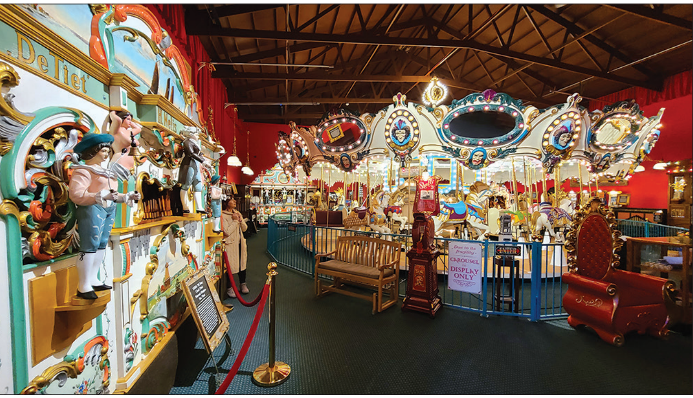
A 1927 Carousel with its hand carved horses is in a special display in the Coney Island Experience room at the Volo Musuem. With self-playing music machines and old-time picture shows, the Coney Island vibe is alive and well.