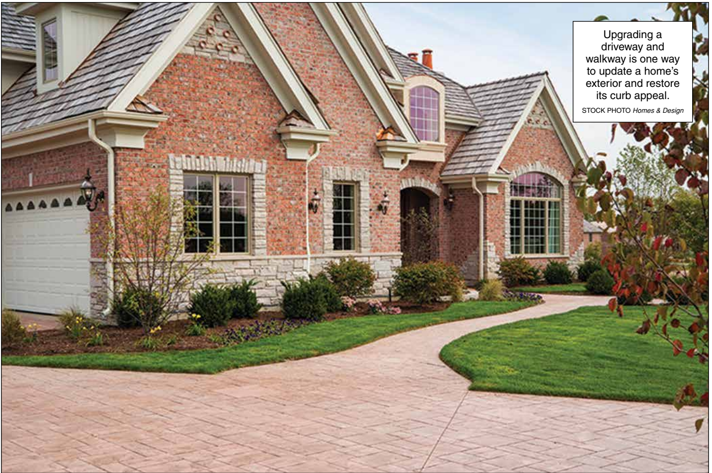
Upgrading a driveway and walkway is one way to update a home's exterior and restore its curb appeal. STOCK PHOTO Homes & Design