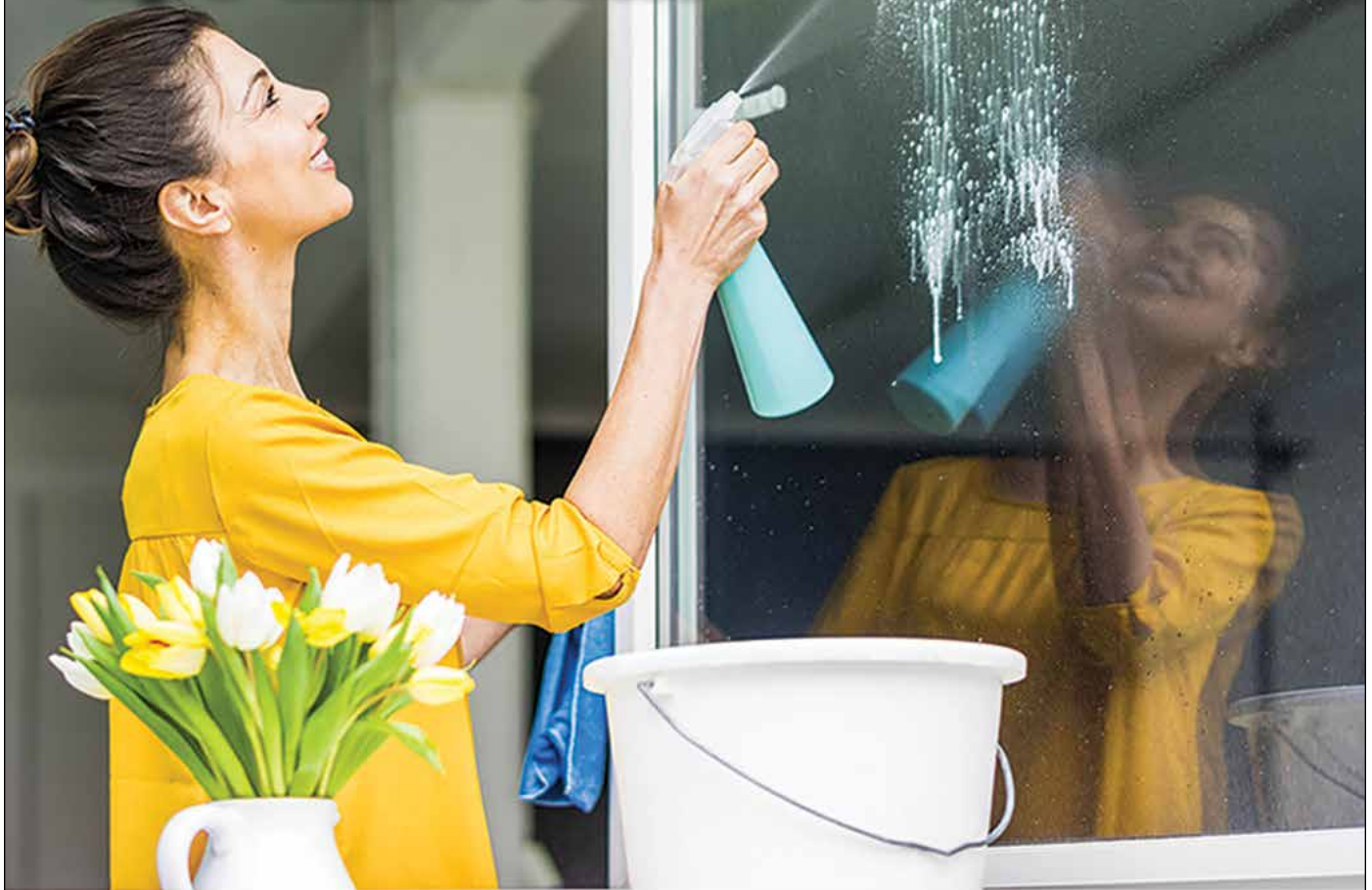
Spring cleaning can bring the revitalizing nature of this beloved time of year into your home.