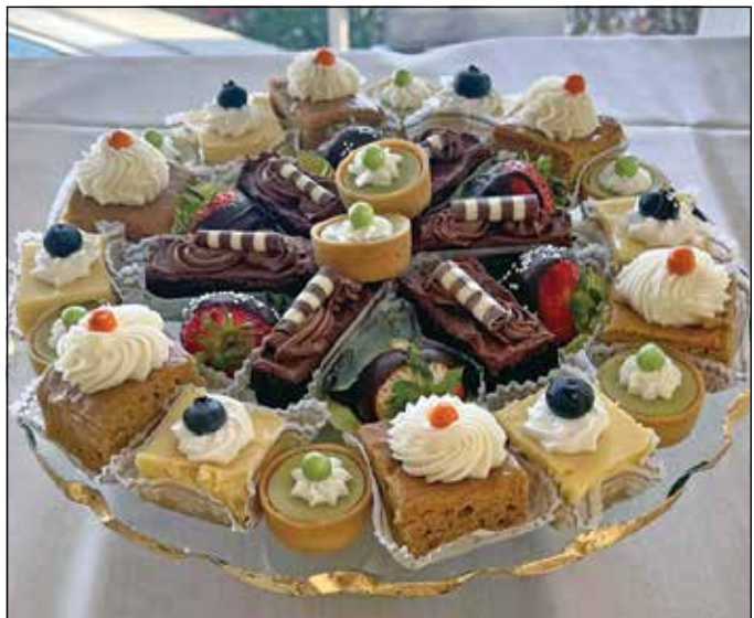
above: Trays of mini desserts offer different tastes for different palates if a wedding cake isn't a couple's style. at left: Even with other options, a traditional wedding cake can make or break an event. below: The bakery offers a large number of gournet cupcake flavors, from savory salted caramel to sweet strawberry shortcake.