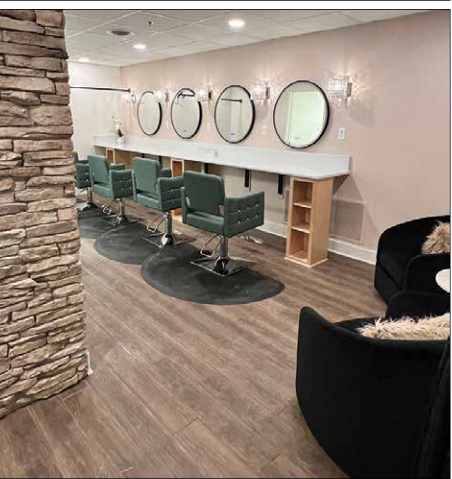
Veterans Terrace, 589 Milwaukee Ave., Burlington, recently unveiled a salon suite during its 14th annual Bridal Showcase. Bridal Guide

has returned to pre-COVID levels. But she has seen some changes, which will be interested to watch, like smaller